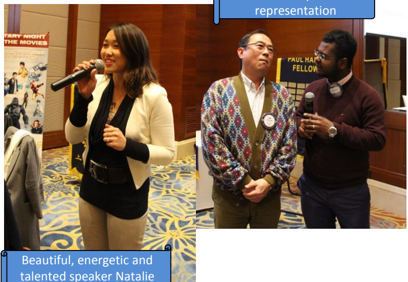
Elevator pitch representation